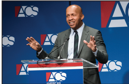
2019 ACS Lifetime Achievement Award winner Bryan Stevenson