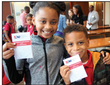
Our Constitution in the Classroom program reached over 34,000 students in 2019

We help our members connect and stay active in their legal communities. ACS chapters provide hands-on opportunities to take action, including notice and comment campaigns, as well as our national staff's work to pair members with pro bono projects and amplify local legal voices. Highlights from 2019 include ACS chapters stepping up to help bring the #MeToo movement to the legal community, holding over 17 events and listening sessions throughout the country; and our Constitution in the Classroom program, through which ACS members educated over 34,000 students across the country about the Constitution, our largest participation to date.