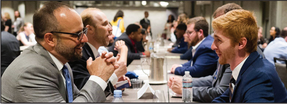
ACS builds relationships between members at our National Convention in Washington DC

Our network is the heart and soul of ACS. It is a source of ideas, innovation, energy, and talent, all focused on achieving a fairer and more just country by advancing and defending the Constitution's fundamental principles of democracy, liberty, access to justice, and the rule of law.