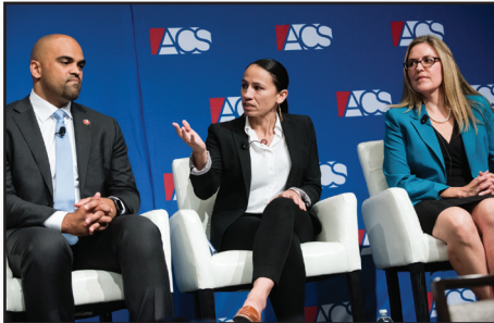
Conversation with freshman Members of Congress Hon. Colin Allred, Hon. Sharice Davids, and Hon. Jennifer Wexton

Panels considered timely issues like structural reform of the Supreme Court; the role that state courts and state constitutions can play in protecting rights and liberties; and the need to develop a comprehensive government reform agenda to repair and safeguard our democracy in the post-Trump era.