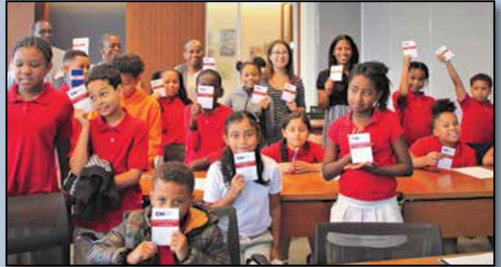
ACS staff and volunteers teaching our Constitution in the Classroom curricula at local area school

Working with local and state bar organizations, ACS members have taught thousands of students in the decade since we began the program. In conjunction with Constitution Day, Law Day, and our new Valentine's Day initiative to Love Our Constitution, our network has helped excite young minds about their constitutional rights and responsibilities. Our Constitution in the Classroom series is one of our many volunteer activities available to members. Email LCEmails@acslaw.org to learn more about volunteer opportunities in your area.