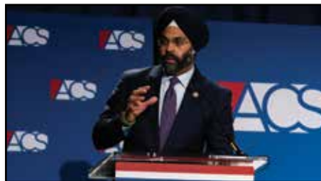
New Jersey Attorney General Gurbir Grewal notes in his keynote address that “states must lead the way in advancing progressive values”