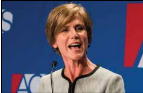
Former Deputy Attorney General Sally Yates delivers impassioned keynote address telling attendees that “this is not a time to be passive”

Select panels from this year activated the legal community on “#MeToo, Ustoo. Can Lawyers Take the Lead?,” “Religious Freedom v. Anti-Discrimination Laws: Can Rights be Reconciled,” and “Under Pressure: Immigrants and the Trump Administration.”