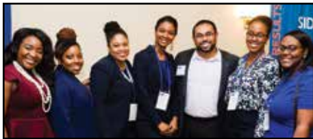
ACS members gather for our Members of Color reception

SAVE THE DATE! 2019 National Convention in Washington, DC: June 6-8, 2019