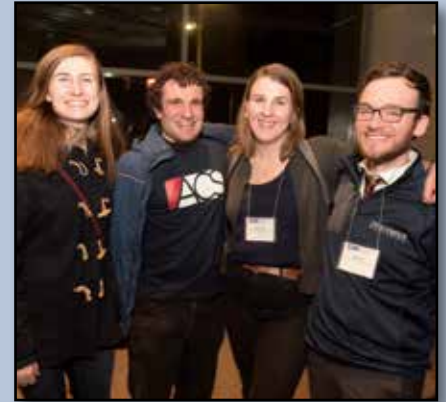
ACS students gathered for Convention

Nearly 200 students from 34 states and the District of Columbia joined us in Chicago for the 2018 ACS Student Convention. Speakers included Illinois Attorney General Lisa Madigan, President and CEO of the Leadership Conference on Civil and Human Rights Vanita Gupta, and President of Let America Vote Jason Kander.